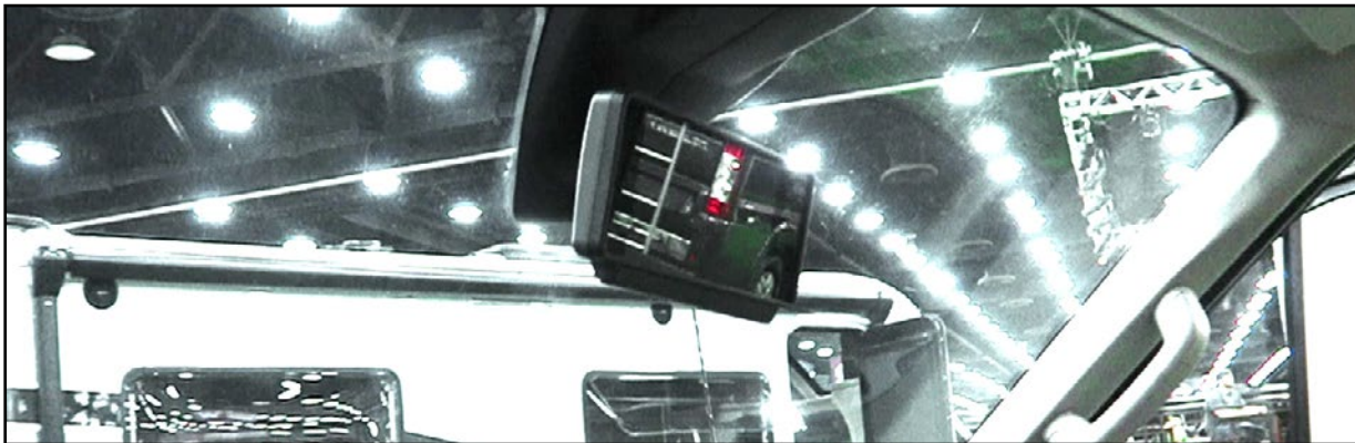
MONITOR MOUNTED ON WINDSHIELD IN A CAB