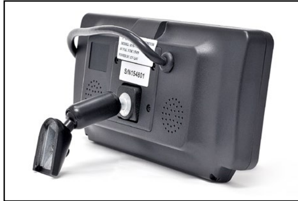
MOUNTS TO WINDSHIELD LIKE REAR VIEW MIRROR